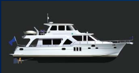
CORDOVA 65 - NEW MODEL