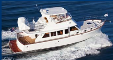
CORDOVA 52 - SERIES II - NEW MODEL