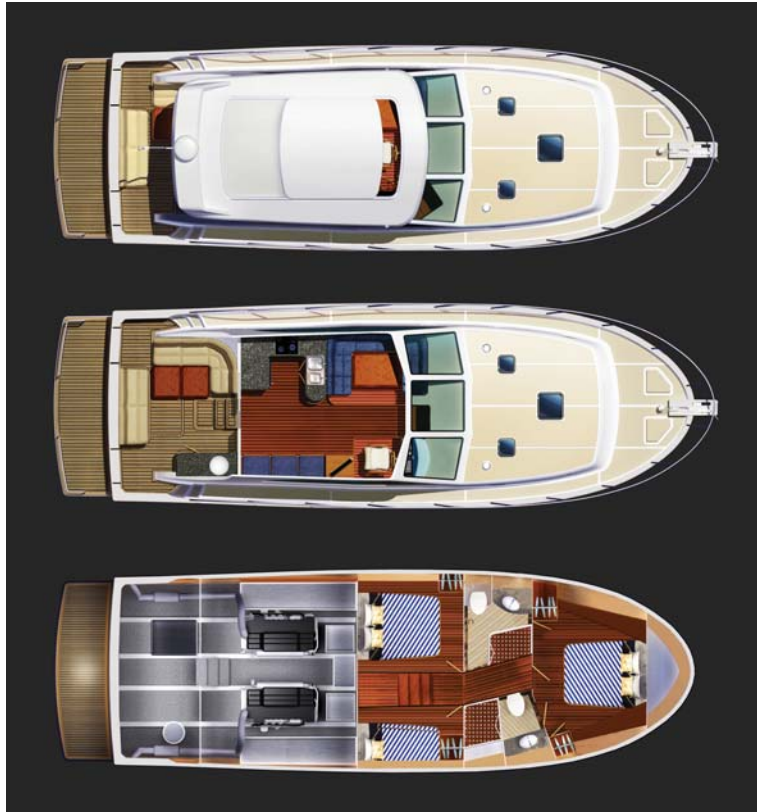
Three cabin layout