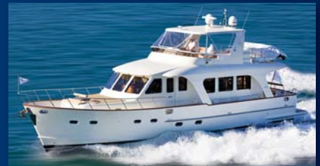
CORDOVA 60 - NEW MODEL