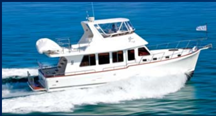
CORDOVA 48 - NEW MODEL