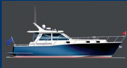
HUDSON BAY 47 - NEW MODEL