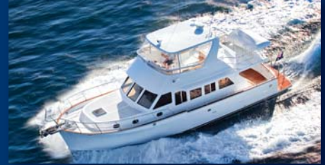
CORDOVA 45 - NEW MODEL