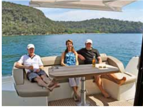
The aft cockpit has a U-shaped lounge and a table that converts, with an extra cushion, to a sunlounge. Overhead, a sun shade extends on powered rams to provide as much shelter as required.

The helm station is to starboard at the front of the saloon beneath a full-width sunroof that electrically retracts to open up the entire front half of the cabin. When closed, the sunroof has two large skylights with slide-out blinds (more of those on the side windows, too), so there is total control of the amount of sunlight and fresh air that the crew can enjoy – or, equally, be protected from in adverse conditions. It delivers indoor-outdoor flexibility and was an important aspect for Brett and Darren in choosing the 500S as it does, indeed, give the opportunity to enjoy the boat all year round.